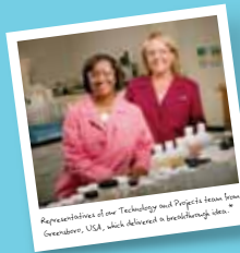
Representatives of our Technology and Support team from Greenduro, USA, which delivered a breakthrough idea.*

"Now I can be confident that I won't lose my crop to resistant weeds."