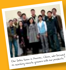
Our Sales team in Yunnan, China, who focused on reaching remote growers with our products.*

"Getting more out of our land has made a real difference to my family."